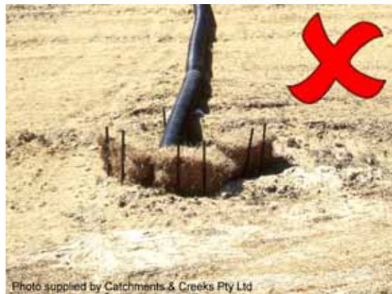
Photo 10 – Inappropriate flow release