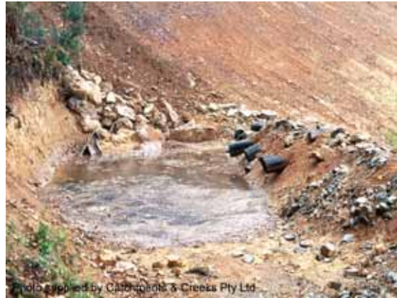
Photo 4 – Slope drains (right) used as an outlet structure for a sediment trap