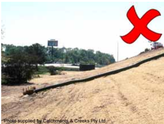
Photo 9 – Inappropriate flow release